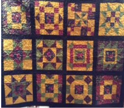
Block of the Month 2018