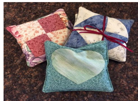
Pocket Warmer Rice Bags