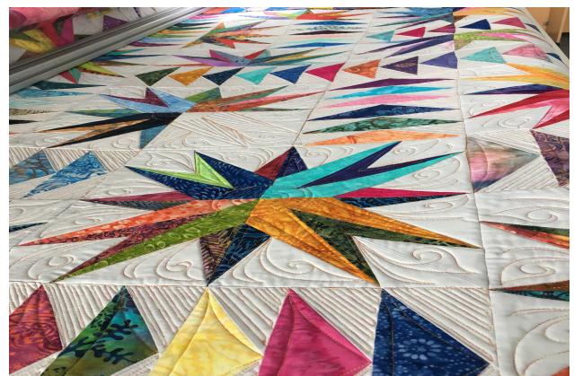
Rhapsody of Stars – WQG Raffle Quilt 2018