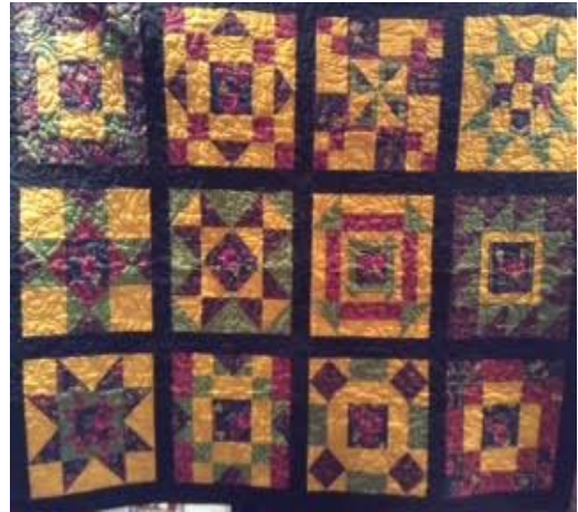
Block of the Month 2018

If you haven't heard yet, Jill Cochrane has thought of a fun new activity for the year 2018. She will be conducting a Block of the Month adventure!